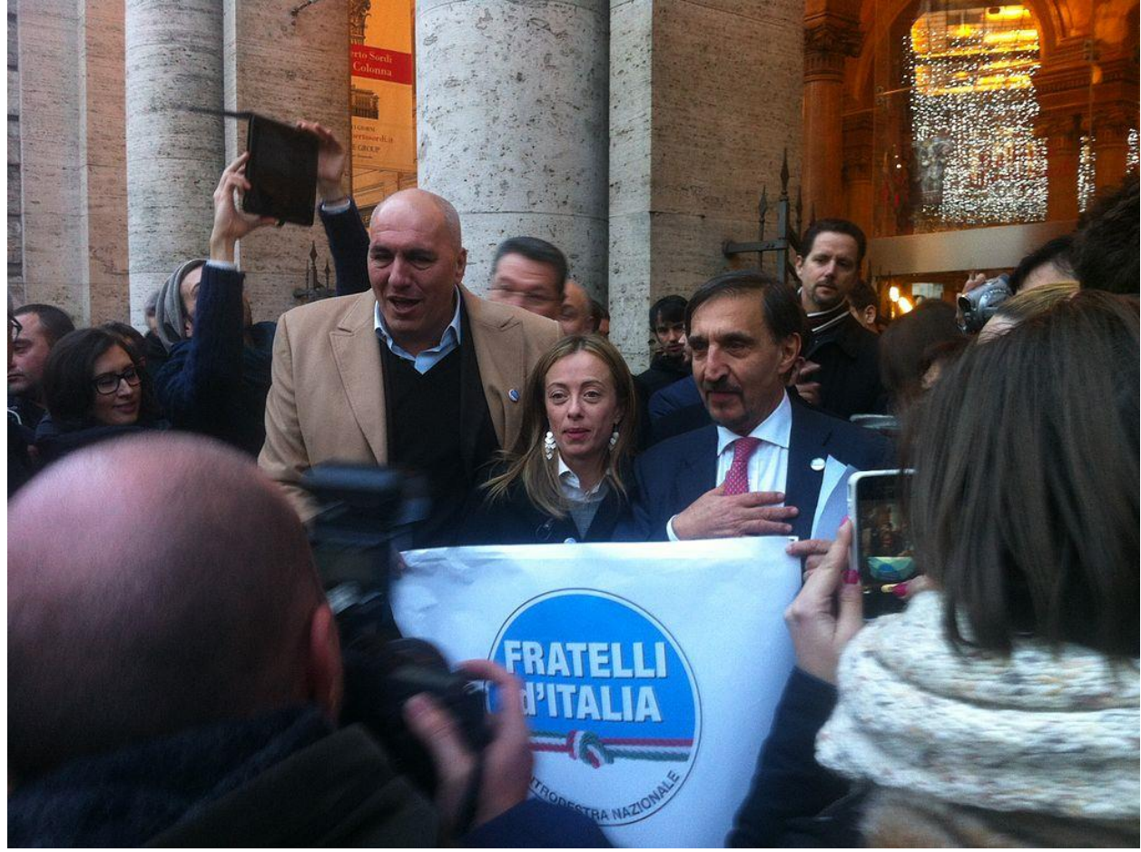
Guido Crosetto, Giorgia Meloni and Ignazio La Russa at the press conference which announced the foundation of the Brothers of Italy in 2012.

Besides being a hub for committed fascists, FdI has discernible ties to the Calabrian mafia. In December 2020, the independent TV program Report revealed that of all current Italian parties, Fratelli d'Italia had the highest number of representatives who were arrested for their affiliation with the mafia group 'Ndrangheta.<sup>42</sup>