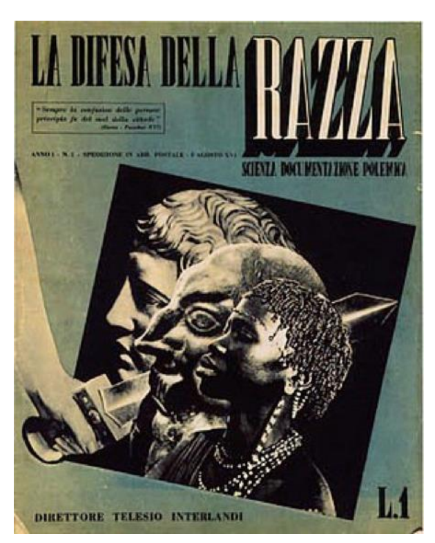
Cover of the first issue of La Difesa Della Razza .

The MSI included various dignitaries of the Salò Republic. It was founded and for the longest period headed (1969–1987) by Giorgio Almirante (1914–1988), a Nazi collaborator, who previously had been involved in the Republican Fascist Party and its predecessor, the National Fascist Party (1921–1943). As editor-in-chief of the antisemitic and racist magazine La Difesa della Razza (the defense of the race, 1938–1943), funded by the Ministry of Popular Culture, Almirante was responsible for the promulgation of the Italian racial laws, kicked off by the publication of the "Manifesto of Race" in 1938, which stripped Italian Jews and and native African inhabitants of the Italian colonies of their citizenship.