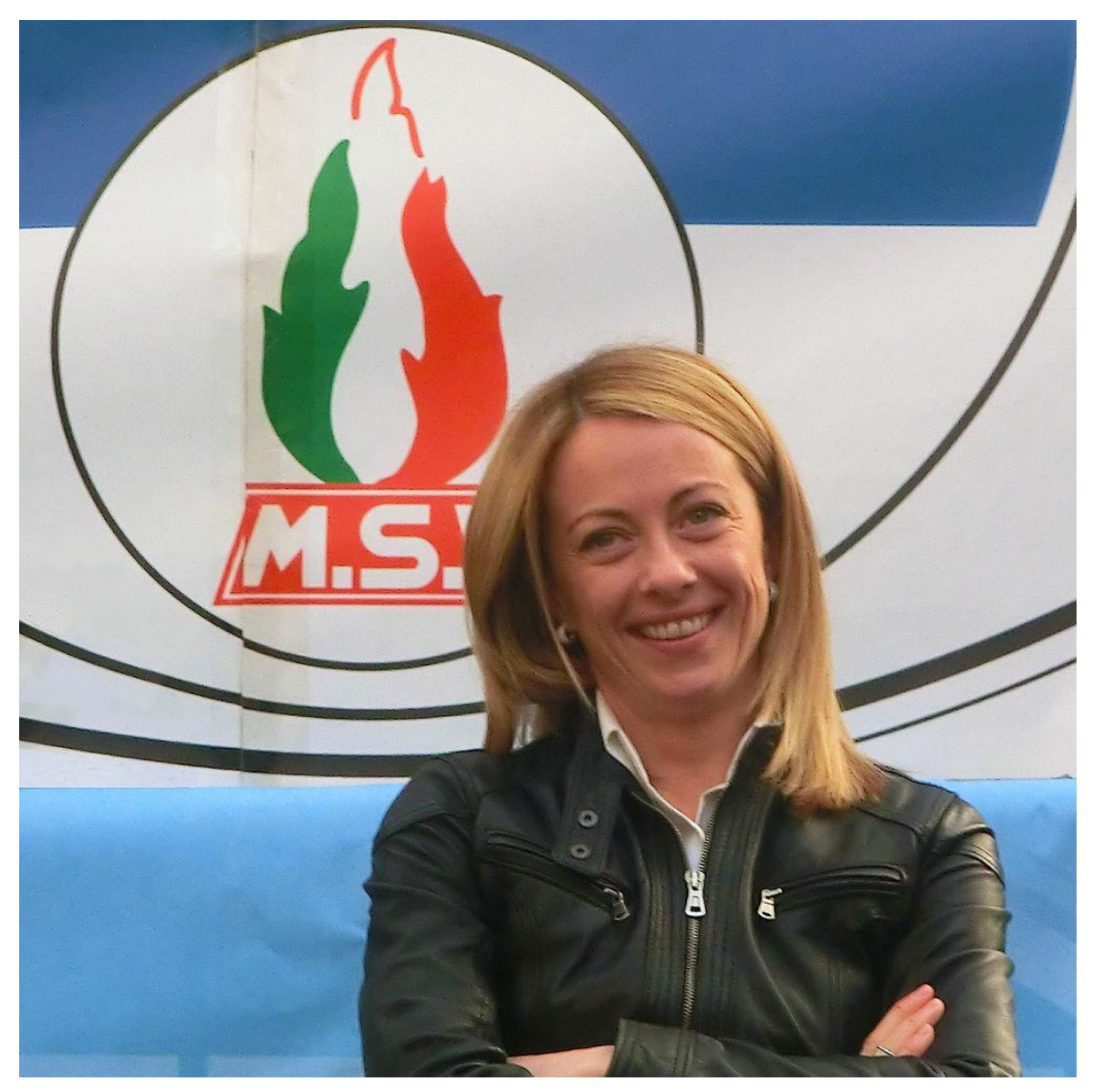
Giorgia Meloni in Sanremo during the electoral campaign for the 2014 European elections.

Berlusconi's fourth cabinet was a treacherous alliance of right-wing to neofascist parties, most of which merged into the big-tent right-wing party, Il Popolo della Libertà (the People of Freedom, PdL), lasting from 2007 to 2013, which Meloni and her party Alleanza Nazionale also joined. Berlusconi abandoned his own party, Forza Italia, to head the new catch-all party, which notably merged Forza Italia; Alleanza Nazionale; and Azione Sociale (Social Action, 2003–2009), a short-lived neofascist party founded by Alessandra Mussolini, the granddaughter of Benito Mussolini. The Berlusconi cabinet was supported by a coalition between PdL and Lega Nord (Northern League), together with other smaller right-wing parties. Meloni took over the presidency of the PdL's youth wing, Giovane Italia (2009–2014), which carried the name of the MSI's first youth organization, and, as its