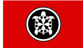
Casa Pound Symbol.