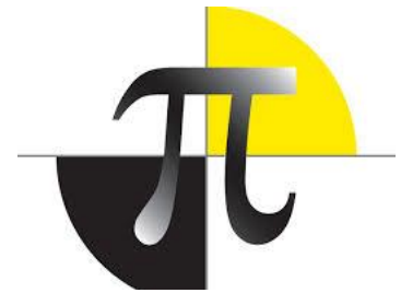
Polaris Symbol.