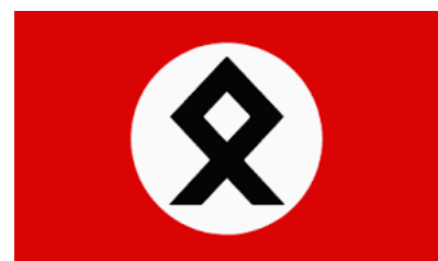
Avanguardia Nazionale Symbol.

Avanguardia Nazionale traces its lineage back to the MSI and the fissures that divided the party during the 1950s. The schism began during the 1954 party congress, which resulted in Arturo Michelini’s (1909–69) ascent to party leadership. Michelini’s rise signaled a shift in party strategy toward endorsing electoral competition and working within the system to gain power. Those opposed to this strategy rallied behind Pino Rauti (1926–2012), who founded Ordine Nuovo as a sect within the party. In 1957,