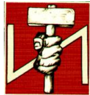
Terza Posizione Symbol.