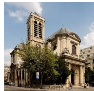
Saint-Nicolas du Chardonnet Church.

Perhaps even more indicative of Adinolfi's links to the traditionalist Catholic space was his regular attendance at Saint-Nicolas du Chardonnet Church in Paris during the 1990s (and perhaps even before). The Church has a surprisingly dramatic history—on February 27, 1977, the building was forcibly occupied by members of the Society of St. Pius X, a schismatic Catholic sect founded in 1970 by Archbishop Marcel Lefebvre (1905–91) to resist the reforms of the Second Vatican Council (1962–65). Efforts by the Archdiocese of Paris to evict the SSPX supporters proved futile, and the church has remained under the group's control ever since. Interestingly, Adinolfi wrote that he often attended the church with his French friends, including some members of GRECE, “when they [were] not pretending to be pagans.” 39 In fact, he specifically stated that Alain de Benoist used to engage in friendly debates with the parish priest, Guillaume de Tanoüarn (b. 1962) (even more recently, Tanoüarn wrote the preface to de Benoist's 2023 book on the philosopher Martin Buber). 40 Furthermore, Adinolfi claimed to have maintained this connection even after his return to Italy—inviting Tanoüarn to visit the CasaPound headquarters in Rome some years later (unclear dates but likely mid-2000s).