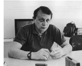
Stefano delle Chiaie.