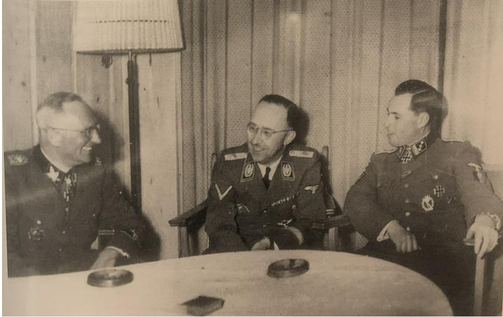
Léon Degrelle (right) meeting with Heinrich Himmler (center) and Herbert-Otto Gille (left) at Hitler's Rastenburg headquarters on February 20, 1944.